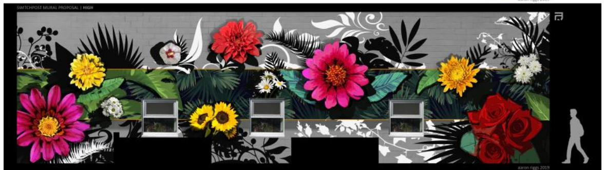
Top: Rendering of a public art project at 3212 N Main St.