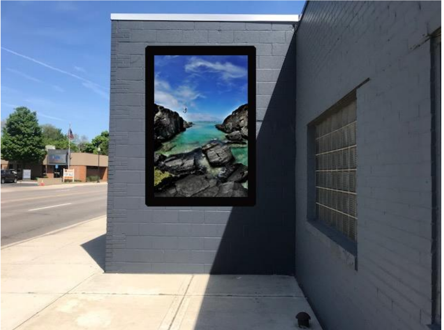
Above: A rendering of the proposed public art project from Robert Bruce Photography.

The CFA continued its role in 2018 as an advisory body for the Royal Oak City Commission. During the year, the CFA brought forth recommendations on two different public art programs. The CFA also voiced support for city commission projects, such as the creation of funding for a Royal Oak Artist in Residence Program (now being called the Royal Oak Artist Laureate).